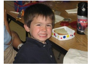
At lunch with our pre-k pals...