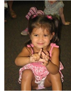
Learning a little Sign Language...