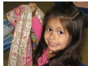
And before ya know it, school's done and it's time to play outside!!!