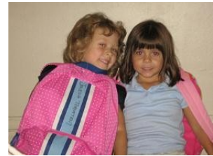
Some of those pre-K backpacks are as